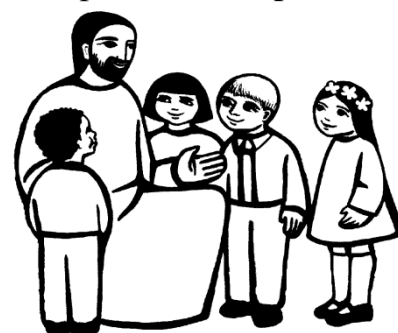
He taught them at some length

“Shepherd” is one of the key descriptions of God in the Scriptures, the one who feeds, protects and nurtures his flock in every way. This image provides the theme for today's readings. God is shepherd of a suffering people – exploited in the first reading, spiritually starving in the Gospel. In the psalm he is the one who supplies all our needs, who feeds, gives rest, leads to the “restful waters” and revives “the drooping spirit” . He guides, he is true, he is by our side “in the valley of darkness He gives comfort, gives dignity “my head you have anointed with oil” . Then the great climax “in the Lord's own house shall I dwell for ever and ever” .